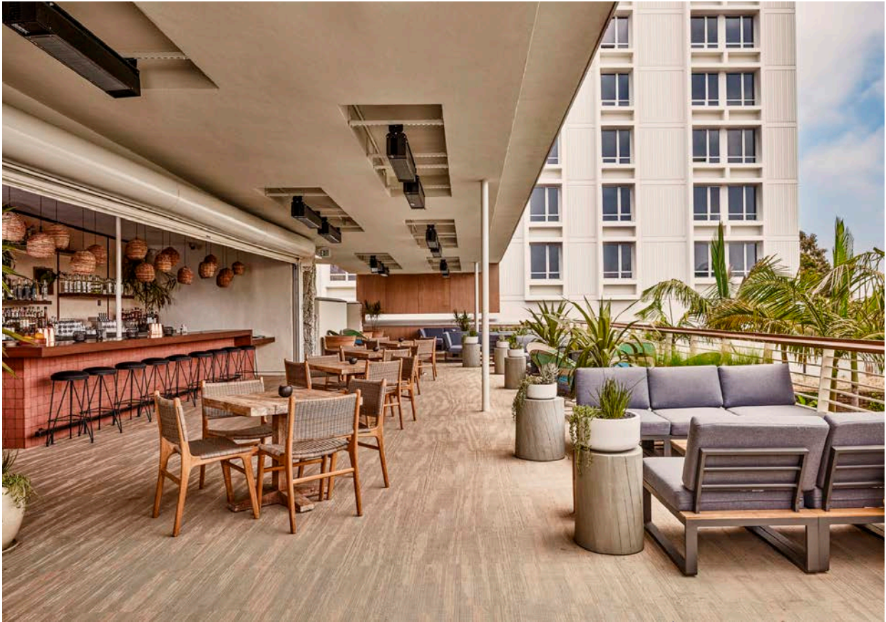
THIS PROJECT CELEBRATES THE ORIGINAL MID-CENTURY ARCHITECTURE WHILE ADDING A CONTEMPORARY TWIST IN EVERY AREA.