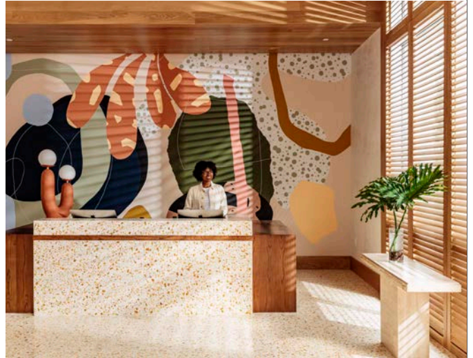
INSPIRED BY THE BRIGHT SPIRIT OF THE WEST COAST, STUDIO COLLECTIVE DESIGNED RELAXED INTERIOR SPACES WITH LIGHT NATURAL WOODS, NATIVE FABRICS, HANDMADE TILES AND LOCAL ART.

the surrounding mountains, Hotel June comprises 250 rooms decorated with a calming, neutral palette, reflective of the natural materials used by Studio Collective. Stained white oak and sisal help to create a relaxed feel, as if the hotel were a beach house, and also highlight the California sunlight. The very pale blue paint applied from the floor up to around the 60-inch mark on all the rooms' walls, and the pale blue bathroom tile are nods to the tones of the nearby Pacific Ocean. More playful pops of color, such as deep green, mustard yellow, orange and terracotta, among others, and motifs were used in the lobby, restaurant and poolside exterior areas through the furnishings and artworks.