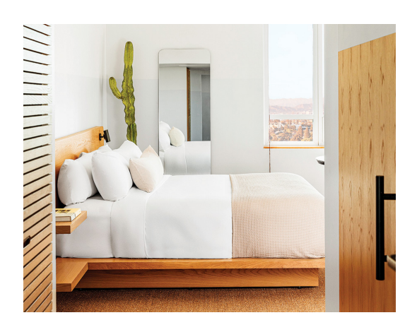
TOP: Custom whiteoak shutters filter sunlight in the lobby of LA's Hotel June. LEFT: Guest rooms are decorated in coastal tones for a very California feel.

or an extra dose of California cool when staying or playing in the Golden State, pay a visit to the charming, 250-room Hotel June, which opened this past spring in Los Angeles. The boutique lodging from LA-based Proper Hospitality is located in a mid-century modern building by celebrated LA architect Welton Becket, who's known for designing significant structures including the Beverly Hilton Hotel. LA design agency Studio Collective honored »